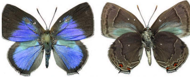
A male butterfly from the newly discovered Thereus lomalarga species was reared in Colombia.

Female butterflies generally choose among male suitors, but in the tropics with hundreds of close relatives living in close proximity, how can they decide which males are the right ones? After all, if she mates with a male of another species, she is unlikely to have surviving offspring. One solution is that males of some species have scent producing organs on their wings, so if a male has the right smell, the female will presumably be receptive to his advances. Strangely, males of some species lack these scent producing organs, which would seem to be a huge disadvantage.