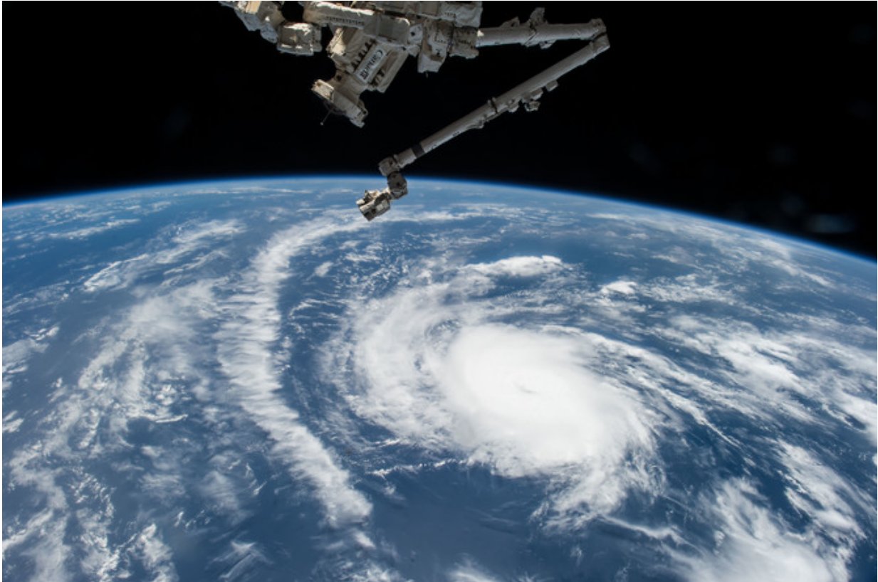
Hurricane Danny photographed by NASA astronaut Scott Kelly from the International Space Station over the Atlantic Ocean.

brother, Mark Kelly , who is a retired astronaut. They are participating in a twin study examining the effects of space on Scott and comparing with what happens to Mark while he remains on Earth. Blood samples from this study have now been sent back to Earth with the returning on the spacecraft.