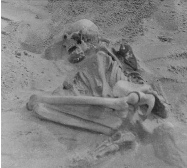
A photo of Tiree skeleton in situ, taken during the original excavation in 1912

Rickets has been identified in a Neolithic skeleton from the Scottish island of Tiree, making it the earliest case of the disease in the UK, according to research announced at the British Science Festival in Bradford.