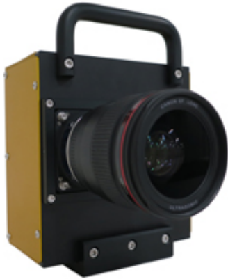
A camera prototype equipped with the newly developed CMOS sensor. (Shown with EF35mm f/1.4 USM lens.)

Canon Inc. announced today that it has developed an APS-H-size (approx. 29.2 x 20.2 mm) CMOS sensor incorporating approximately 250 million pixels (19,580 x 12,600 pixels), the world's highest number of pixels for a CMOS sensor smaller than the size of a 35 mm full-frame sensor.