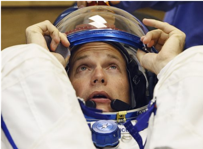
Denmark's astronaut Andreas Mogensen, member of the main crew of the expedition to the International Space Station (ISS), inspects his space suit prior the launch of Soyuz-FG rocket at the Russian leased Baikonur cosmodrome, Kazakhstan, Wednesday, Sept. 2, 2015.