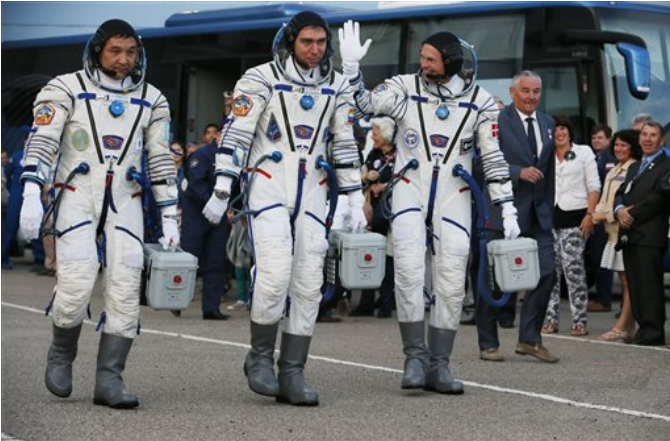
Kazakhstan's cosmonaut Aydyn Aimbetov, left, Russian cosmonaut Sergei Volkov, center, and Denmark's astronaut Andreas Mogensen, members of the main crew of the expedition to the International Space Station (ISS), walk prior the launch of Soyuz-FG rocket at the Russian leased Baikonur cosmodrome, Kazakhstan, Wednesday, Sept. 2, 2015.