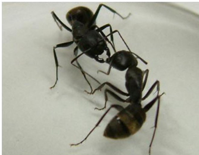
Fig. 1: Communication between Japanese carpenter ants Using one of the antennae on its head, an ant accesses information provided by hydrocarbons on the body surface of another ant, enabling nestmate and caste recognition, and instruction about occupational tasks.

A research group has identified chemosensory proteins (CSPs) that play important roles in communications between worker ants. CSPs may represent a starting point for elucidation of the molecular mechanisms involved in the sophisticated system of communication that supports ants' complex societies, and the evolution of these mechanisms. These findings were published in Scientific Reports on August 27.