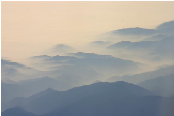
Looking like a traditional Chinese painting, California's coastal mountains are covered in mist.