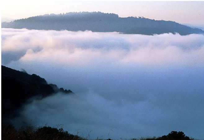
Fog sits over the estuary of the Klamath River along the Pacific Coast.

What do the roof of a building in a West Coast redwood forest, a bluff in California chaparral, and a research vessel in Monterey Bay have in common?