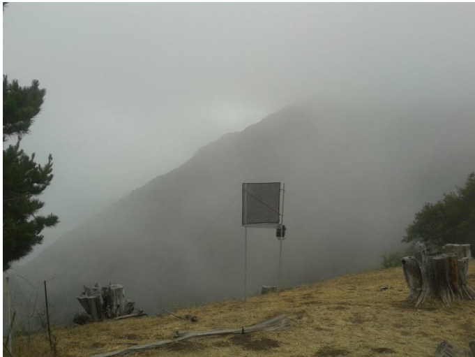
A FogNet station in Big Creek Reserve in California's Big Sur collects fog.

The new data show elevated monomethyl mercury concentrations, similar to those the team revealed at the December AGU conference, as well as in a paper published in 2012 in the AGU journal Geophysical Research Letters .