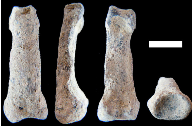
Hands down amazing: nearly 2 million year-old pinkie bone.

sediments dated to more than 1.84 million years ago.