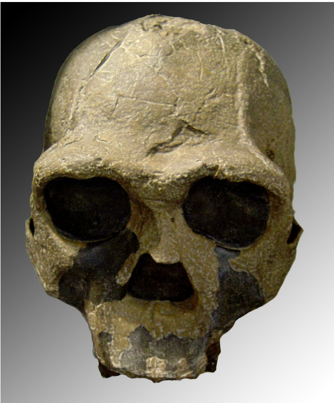
Could the little finger belong to Homo ergaster?

This story is published courtesy of The Conversation (under Creative Commons-Attribution/No derivatives).