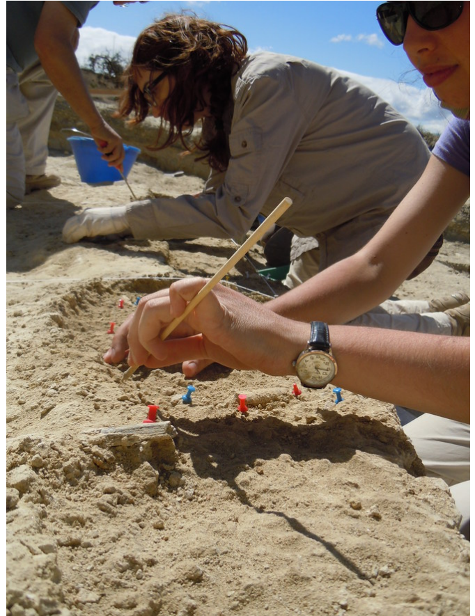
Excavation team. Definitely not all thumbs.

certainly contemporary with Homo habilis . However, while it is contemporary with Oldowan and Oldowan-like tools in Koobi Fora, Kenya, it has never before been discovered in Olduvai Gorge. There there really isn't enough isn't enough evidence to link the