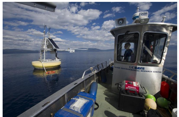
Scientists in the UC Davis Tahoe Environmental Research Center's research vessel check on a NASA-JPL research buoy that collects data about Lake Tahoe.

Low precipitation helped keep runoff from both nutrients and sediment low in 2014.