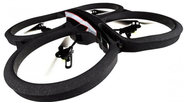
Quadrotor ARDrone Parrot used in this project.

Finally, all systems were shown in an experiment in a greenhouse located at the "plastic sea" in Almería. The robot flew the whole greenhouse in 20 minutes and generated maps of temperature, humidity, luminosity and carbon dioxide concentration . These maps can be used, amongst others, to guarantee optimal environmental conditions for plant growth or to detect leaks of temperature and humidity caused by cover damages.