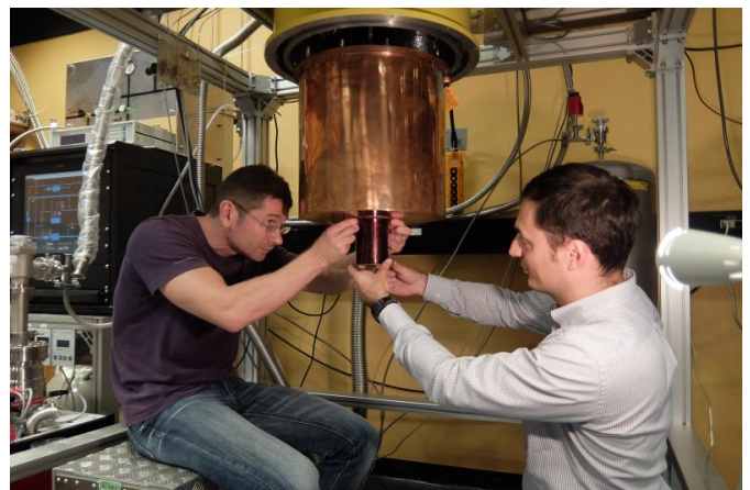
Superconducting magnet for quantum experiment

The nucleus has a tiny internal magnet, called a "magnetic moment," and the electrons orbiting around it also have magnetic moments that are about 1,000 times larger. Those magnets interact with each other, which is called the "hyperfine interaction."