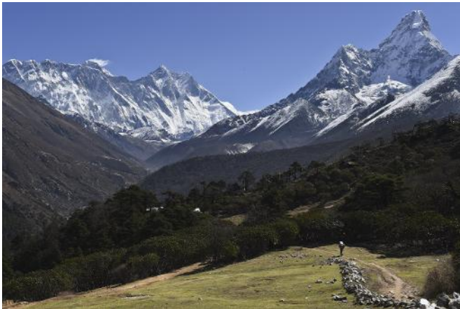
A Nepalese porter carries a load towards Mount Everest and the Himalayas (at left with cloud on top), April 20, 2015

The world's tallest peak, Mount Everest, moved three centimetres (1.2 inches) to the southwest because of the Nepal earthquake that devastated the country in April, Chinese state media reported Tuesday.