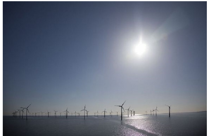
In Denmark, wind power accounts for 28% of the country's electrical production, and is now cheaper than coal power.

In 2015, the world's first grid-connected wave-power station (CETO, named after the Greek goddess of the sea) went online off the coast of Western Australia. Developed by Carnegie Wave Energy, this power station operates under water and uses undersea buoys to pump a series of seabed -anchored pumps, which in turn generates electricity.