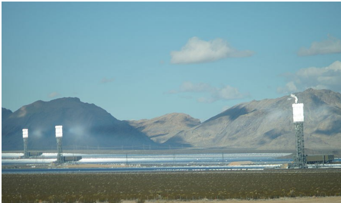
The Ivanpah Solar Power Facility in California, showing its three towers delivering concentrated solar power.

One drawback is the fact that this energy is diffuse, and can only be cheaply harnessed in certain locations. However, in certain areas of the world, such as Iceland, Indonesia, and other regions with high levels of geothermal activity, it is an easily accessible and cost-effective way of reducing dependence on fossil fuels and coal to generate electricity. Countries generating more than 15 percent of their electricity from geothermal sources include El Salvador, Kenya, the Philippines, Iceland and Costa Rica.