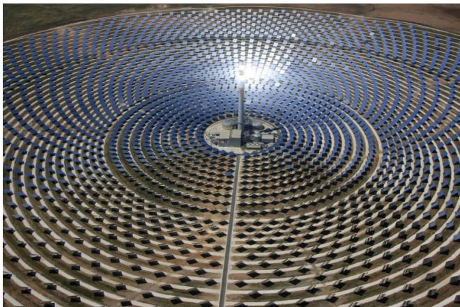
The Gemasolar solar power plant, situated near Seville in Spain.

Renewable energy is becoming an increasingly important issue in today's world. In addition to the rising cost of fossil fuels and the threat of Climate Change, there has also been positive developments in this field which include improvements in efficiency as well as diminishing prices.