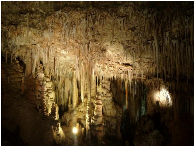
Speleotherms from Soreq Cave, Israel.

An international team of scientists has found a dramatic ice sheet collapse at the end of the ice age before last caused widespread climate changes and led to a peak in the sea level well above its present height.