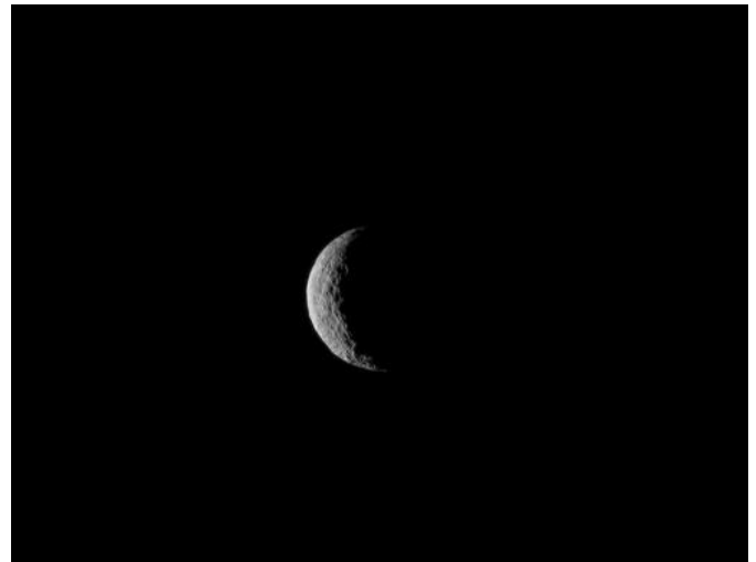
This NASA image obtained on March 6, 2015 shows Ceres, taken by the Dawn spacecraft on March 1, just a few days before the mission achieved orbit

Vesta is bright and reflects much of the Sun's light, while Ceres is dark—a contrast that says these bodies have experienced very different space odysseys.