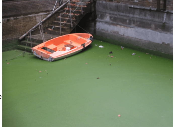
Algal blooms - the green sludge - are on the rise.

Though microscopic organisms residing in the ocean and on the seafloor might seem to have little relevance to us, even small changes in ocean ecosystems can have enormous effects on the entire ocean food chain, from the smallest bacteria to the largest fish. Any impact on the creatures higher up in the food chain will have a massive impact on the human communities that rely on them economically and as a food source.