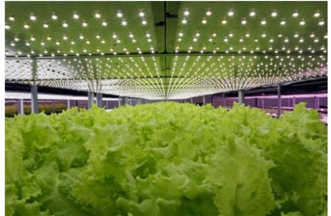
In this photo taken on Wednesday, March 4, 2015, common salad lettuce is seen growing under banks of LED light panels at the ARWIN plant factory in Miaoli, northern Taiwan. Entrepreneurs in Taiwan are combining the island's leading edge in light-emitting diodes (LEDs) with its traditional agricultural know-how to create artificial environments to grow vegetables. These indoor grow-rooms have nutrient-filled water instead of soil and variable LED lighting to imitate the cycle of night and day. They are gaining popularity for raising everything from common lettuce to the exotic South African ice plant, which draws US $400 per kilogram. These LED-lit hydroponic environments yield more crops per area than soil but without the need for traditional toxic pesticides. (AP Photo/Wally Santana)

vegetables. These indoor grow-rooms have nutrient-filled water instead of soil and variable LED lighting to imitate the cycle of night and day. They are gaining popularity for raising everything from common lettuce to the exotic South African ice plant, which draws US $400 per kilogram. These LED-lit hydroponic environments yield more crops per area than soil but without the need for traditional toxic pesticides. (AP Photo/Wally Santana)