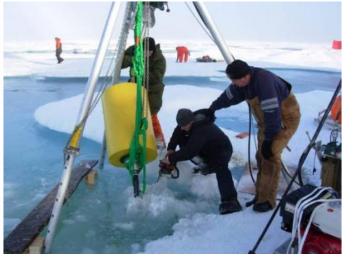
Researchers recover an ITP from the Arctic Ocean.