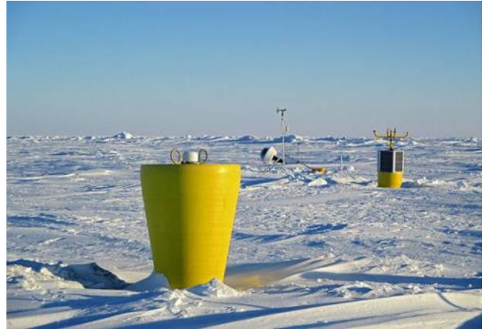
This ITP was installed in the Beaufort Sea in March 2014 to collect data on complex air-ice-ocean interactions that govern sea ice formation and retreat.