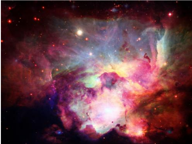
The epoch of the leptons existed for nine seconds after the Big Bang.

It is often claimed that the Ancient Greeks were the first to identify objects that have no size, yet are able to build up the world around us through their interactions. And as we are able to observe the world in tinier and tinier detail through microscopes of increasing power, it is natural to wonder what these objects are made of.