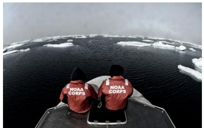
NOAA officers aboard one of the smaller survey vessels contemplate the vastness of the Chukchi Sea during the

Last year, Healy worked with Coast Survey to take depth measurements as "tracklines"— straight paths of transit—while at sea. The survey is basing its new work on Healy's 2014 trackline, along with data collected from 16 transits by the three ships and contractor vessel in 2015, using multibeam sonar. The ships will survey depths in lines that are about a thousand meters apart and a thousand meters wide, as they travel back and forth to major project areas around the Bering Strait and the Arctic.