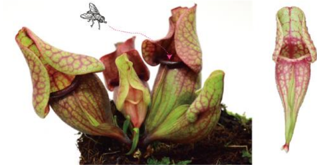
Pitcher-shaped leaves of a carnivorous plant, Sarracenia purpurea .

Carnivorous plants have strange-shaped leaves, and they can grow on nutrient-poor environments by trapping and eating small animals. Charles Darwin, often called "the father of evolution", was also interested in carnivorous plants, and he wrote a book titled "Insectivorous Plants" published in 1875. Since then a lot of researches have been done, but how such strange-shaped leaves were altered during evolution remained unknown.