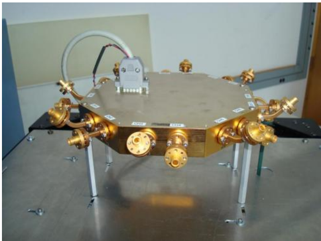
NIST researchers developed this directional 16-antenna array to support modeling of wireless communications channels at 83 gigahertz.

Smartphones and tablets are everywhere, which is great for communications but a growing burden on wireless channels. Forecasted huge increases in mobile data traffic call for exponentially more channel capacity. Boosting bandwidth and capacity could speed downloads, improve service quality, and enable new applications like the Internet of Things connecting a multitude of devices.