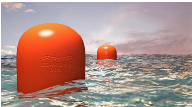
An artists' rendering of the CorPower wave energy converter. Credit: CorPower

Provided by KTH Royal Institute of Technology