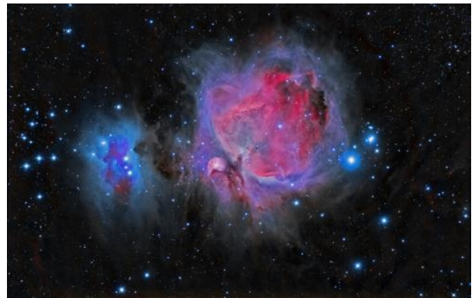
The Orion Nebula.

The Sun was a hungry youngster—it ate up 99% of what was swirling around, NASA says—but this still left 1% of the disc available for other things. And this is where planet formation began.