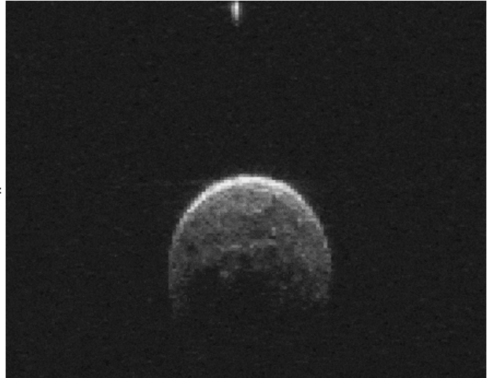
This animation, created from individual radar images, clearly show the rough outline of 2004 BL86 and its newly-discovered moon.

And we need to have a better understanding of external factors that could affect planet formation, such as supernovae (explosions of old, massive stars.) But the protoplanet hypothesis is the best we've got—at least for now.