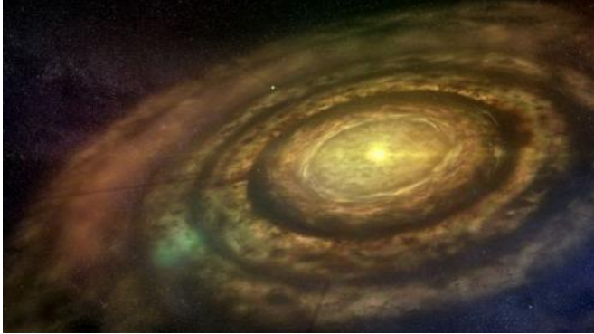
This artist's conception shows a newly formed star surrounded by a swirling protoplanetary disk of dust and gas.

How did the Solar System's planets come to be? The leading theory is something known as the "protoplanet hypothesis", which essentially says that very small objects stuck to each other and grew bigger and bigger—big enough to even form the gas giants, such as Jupiter.