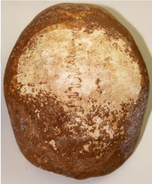
The Manot calotte (original) is in the top view. Well visible are the skull sutures and the brownish calcite patina.