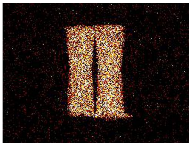
Energy-dispersive X-ray spectroscopy data of elemental zinc in the micromotors.