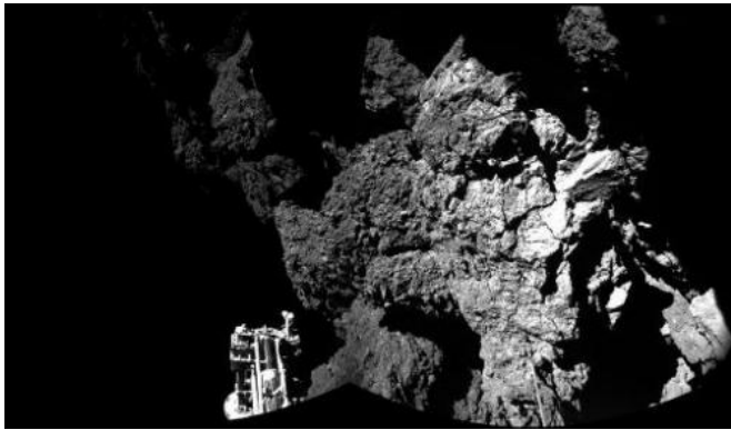
Rosetta's lander Philae is safely on the surface of Comet 67P/Churyumov-Gerasimenko, on November 13, 2014

Suspicion that shooting stars come from comet dust, transformed into fiery streaks as they hit Earth's atmosphere, have been bolstered by Europe's Rosetta space mission, scientists reported Monday.