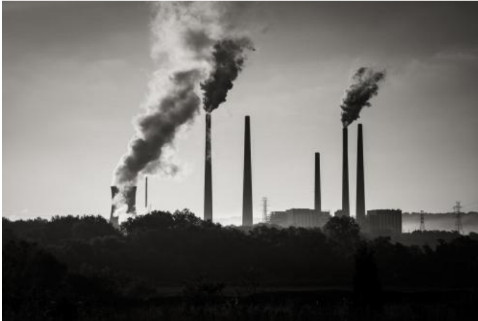
Coal fired power plant on the Ohio River just West of Cincinnati.

While useful, IAMs have to make numerous simplifying assumptions. One limitation, for example, is that they fail to account for how the damages associated with climate change might persist through time. "For 20 years now, the models have assumed that climate change can't affect the basic growth-rate of the economy," Moore said. "But a number of new studies suggest this may not be true. If climate change affects not only a country's economic output, but also its growth, then that has a permanent effect that accumulates over time, leading to a much higher social cost of carbon."