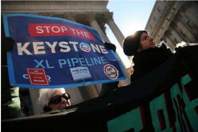
Protesters participate in an anti-Keystone pipeline demonstration in New York's Foley Square on November 18, 2014

A US state high court on Friday overturned a ruling that had blocked construction of the Keystone XL oil pipeline, giving a dramatic victory to supporters of the controversial project.