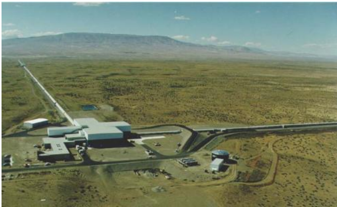
LIGO, the Laser Interferometer Gravitational-Wave Observatory, is a large-scale physics experiment that aims to directly detect gravitational waves. Here is the LIGO Livingston Observatory in Louisiana.

At first, they used a data analysis code from the initial LIGO for the experiment, since it was easy to validate. However over time, they began using the new Advanced LIGO version of the analysis code. Through detailed benchmarking, they were able to verify the reliability of the process and offer a preliminary sense of how much computing and data-crunching capability they needed to transmit, store and analyze data from the observatories for use by the astronomy community.