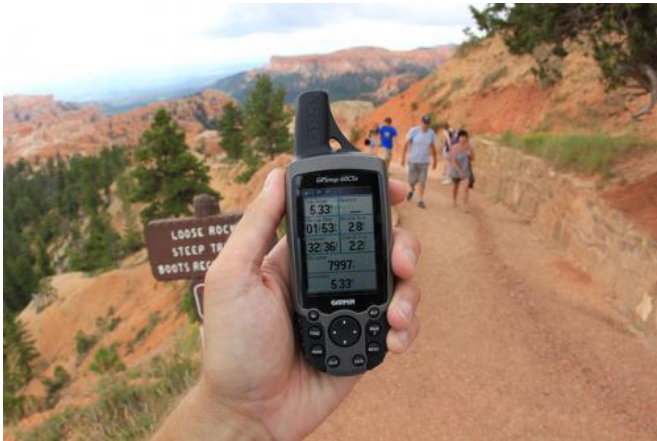
GPS is used in many devices to help us navigate.

It's well known that severe space weather events – which are quite rare – can have a negative impact on our use of Global Positioning System (GPS) enabled devices. But our research, published in Geophysical Research Letters , shows that another form of space weather – which occurs on a daily basis – can cause problems for GPS too.