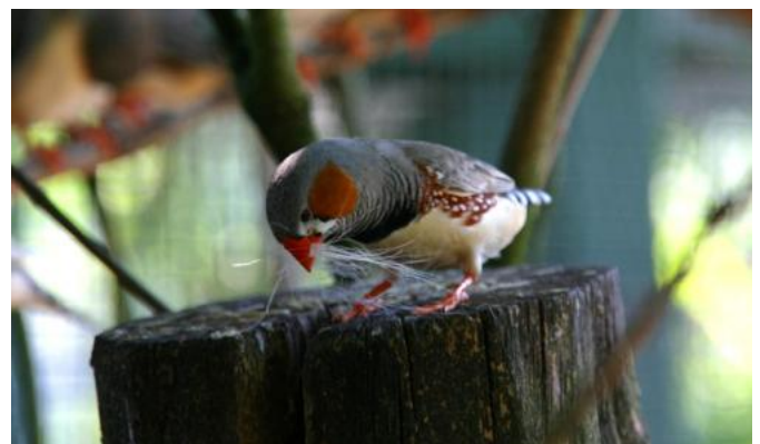
A zebra finch getting ready to line its nest.

We conducted experiments on 17 pairs of zebra finches. Each experimental aviary contained three identical nests as well as nesting material. When the birds chose a nest and laid their first egg, a zebra finch egg was added to one of the additional nests, and a Bengalese finch egg was added to the other. Bengalese finches are a closely related to zebra finches, and lay eggs that are larger and sometimes different in colour to zebra finch eggs.