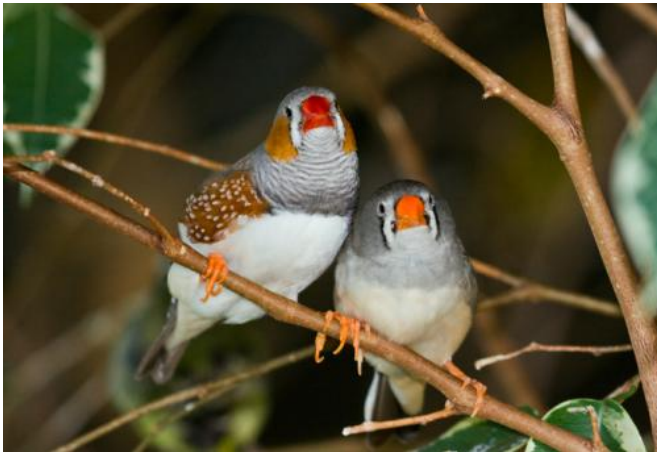
Zebra finches may have the potential to become brood parasites.

Species must reproduce to survive, and animals have found unique ways of achieving this. For some, including us, it seems as though producing a few offspring that require extended care is the best strategy. For others, such as many coral reef fishes, many offspring that require little care appears better suited.