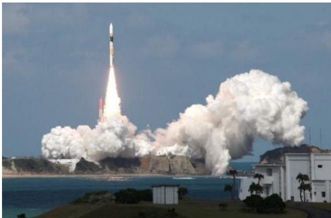
Japan's H-IIA rocket blasts off from the Tanegashima Space Center in southern Japan on October 9, 2014

Bad weather will delay the launch of a Japanese space probe on a six-year mission to mine a distant asteroid, just weeks after a European spacecraft's historic landing on a comet captivated the world.