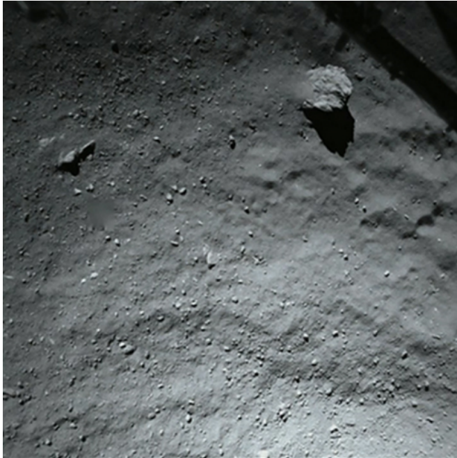
Comet from 40 metres.

(Phys.org) —After achieving touchdown on a comet for the first time in history, scientists and engineers are busy analysing this new world and the nature of the landing.