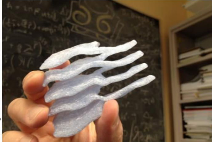
A 3D-printed model using data from actual endoplasmic reticulum sheets.

"So how do you get as many ribosomes per unit volume as possible but not have them bump up against each other?" Huber asked. "The cell seems to have solved that problem by folding surfaces into layers that are nearly parallel to each other and allow a high density of ribosomes."