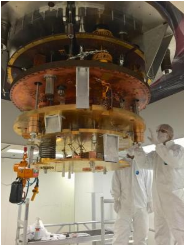
Scientists inspect the cryostat of the of the Cryogenic Underground Observatory for Rare Events.

In an underground laboratory in Italy, an international team of scientists has created the coldest cubic meter in the universe. The cooled chamber—roughly the size of a vending machine—was chilled to 6 milliKelvin or -273.144 degrees Celsius in preparation for a forthcoming experiment that will study neutrinos, ghostlike particles that could hold the key to the existence of matter around us.