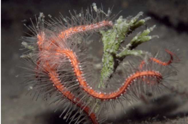
A brittle star feeding off Lizard Island, Queensland. J Finn/Museum Victoria, Author provided

A complete tree of life – showing how and when organisms are related to each other – has long been desired by biologists, but obscured by the vagaries of the fossil record.