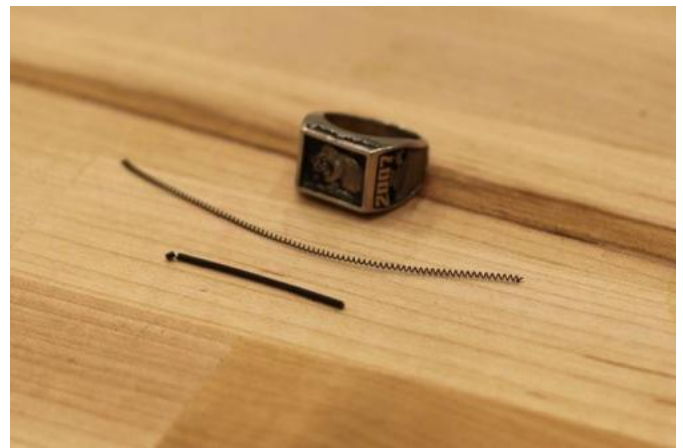
Two shape memory alloy (SMA) coil actuators, shown in their stretched and contracted states.

essentially be "trained" to return to an original shape in response to a certain temperature. To train the material, Holschuh first wound raw SMA fiber into extremely tight, millimeter-diameter coils then heated the coils to 450 degrees Celsius to set them into an original, or "trained" shape. At room temperature, the coils may be stretched or bent, much like a paper clip. However, at a certain "trigger" temperature (in this case, as low as 60 C), the fiber will begin to spring back to its trained, tightly coiled state.