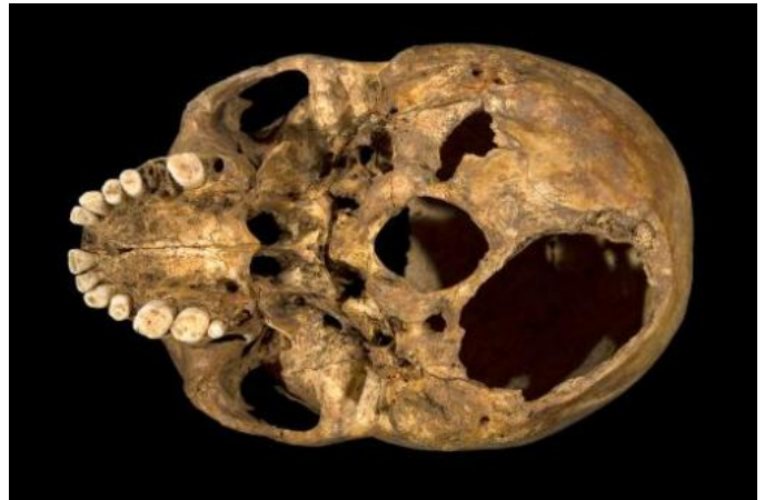
An undated handout picture released on February 4, 2013 from the University of Leicester shows the base of the skull of king Richard III with the two potentially fatal injuries

One was a blow to the right tenth rib with what was probably a fine-edged dagger.