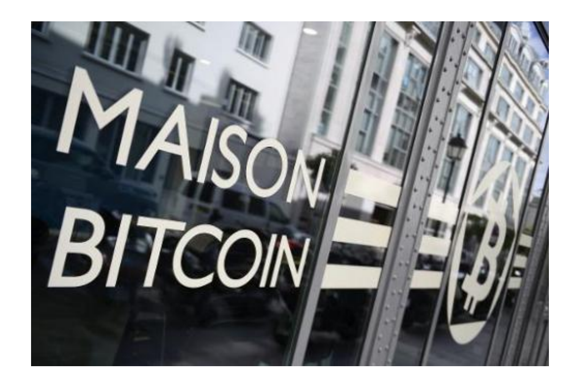
La Maison du Bitcoin in Paris on June 20, 2014

Bitcoin—a virtual currency that can be used to pay for goods from a computer or mobile device—is not currently subject to legislation.