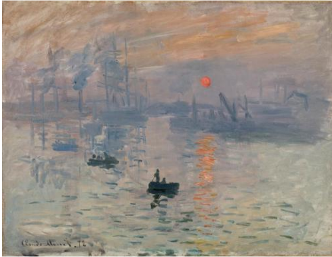
Claude Monet, Impression, Sunrise (W263)