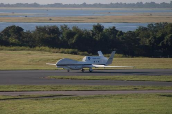
The NASA Global Hawk 872 lands at 7:43 a.m. EDT, Aug. 27, at the Wallops Flight Facility in Virginia following a 22-hour transit flight from its home base at the Armstrong Flight Research Center in California.

The first of two unmanned Global Hawk aircraft landed at NASA's Wallops Flight Facility in Wallops Island, Virginia, on Aug. 27 after surveying Hurricane Cristobal for the first science flight of NASA's latest hurricane airborne mission.