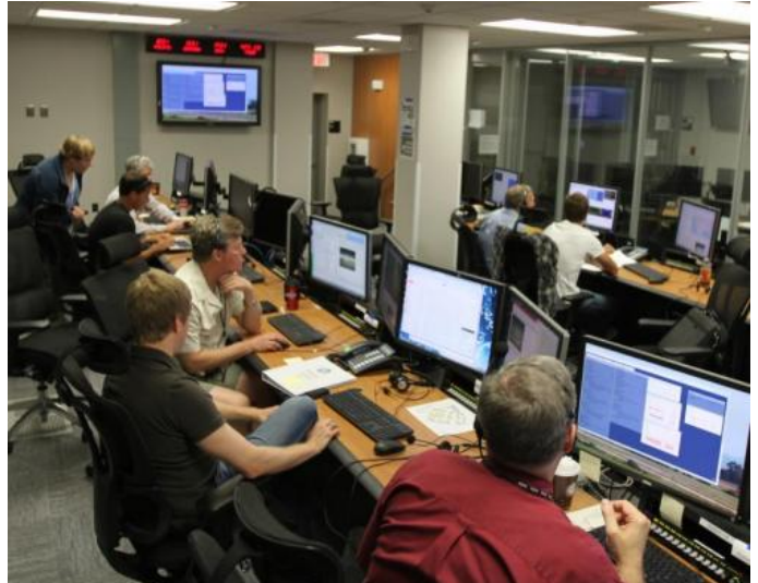
Members of the HS3 team monitor the transit flight of the NASA Global Hawk 872 aircraft. The aircraft departed the Armstrong Flight Research Center in California at 9:08 a.m. EDT on Aug. 26.