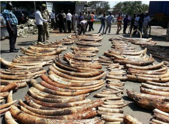
A Kenya Wildlife Services photo shows ivory seized at Mombasa port on July 8, 2013

While UN experts disputed the findings, many would back WildLeaks' message: stopping poaching requires action against the wealthy and influential bosses of often extremely well connected organised crime gangs.