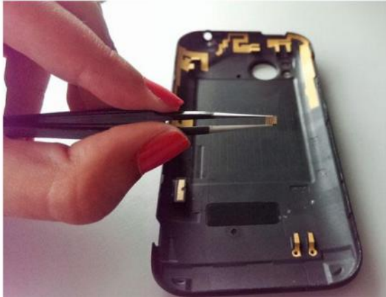
A WiSpry MEMS tunable capacitor shown in front of a phone cover with visible antennas.

A loss mechanism that has not been an issue in previous mobile handset antennas will become important for global 4G roaming, according to results of experiments carried out in Aalborg, Denmark.