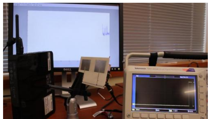
Wi-Fi backscatter equipment.

This work builds upon previous research that showed how low-powered devices such as temperature sensors or wearable technology could run without batteries or cords by harnessing energy from existing radio, TV and wireless signals in the air. This work takes that a step further by connecting each individual device to the Internet, which previously wasn't possible.