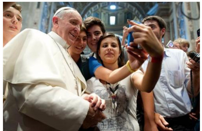
In this file photo Wednesday, Aug. 28, 2013 Pope Francis has his picture taken inside St. Peter's Basilica with youths from the Italian Diocese of Piacenza and Bobbio who came to Rome for a pilgrimage, at the Vatican.

A Business Insider story from January noted that the outstretched arm of the photo-taker in usies is a "signature" of the image, because the shooter has to get the camera far enough away to get the group in the frame. The Times of India in March said Pope Francis' group selfie with visitors at the Vatican last year "could possibly be the first chronicled celebrity usie." And a PopStopTV.com report from June was headlined: "Selfies Are Dead, Usie is the Latest Trend!"