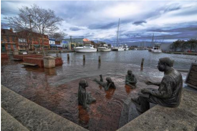
Annapolis, Md., pictured here in 2012, saw the greatest increase in nuisance flooding in a recent NOAA study.

Eight of the top 10 U.S. cities that have seen an increase in so-called "nuisance flooding"—which causes such public inconveniences as frequent road closures, overwhelmed storm drains and compromised infrastructure—are on the East Coast, according to a new NOAA technical report.