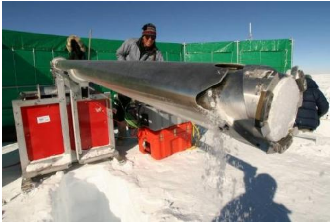
A shallow firn core was drilled during the Norwegian-American Scientific Traverse of East Antarctica.

"Lead is a toxic heavy metal with strong potential to harm ecosystems," said co-author Paul Vallelonga of the University of Copenhagen. "While concentrations measured in Antarctic ice cores are very low, the records show that atmospheric concentrations and deposition rates increased approximately six-fold in the late 1880's, coincident with the start of mining at Broken Hill in southern Australia and smelting at nearby Port Pirie."