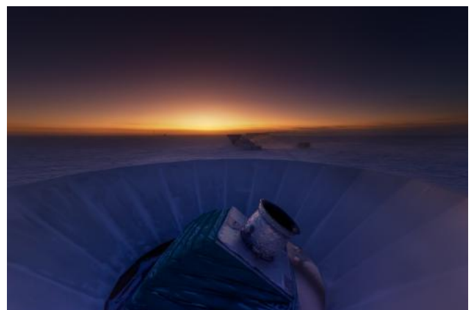
The BICEP2 telescope in Antarctica, seen at twilight. The telescope has led to significant new results on the early universe. The Keck Array telescope and the Amundsen-Scott South Pole Station can be seen in the background.

Measurements of the Higgs boson have allowed particle physicists to show that our universe sits in a valley of the 'Higgs field', which describes the way that other particles have mass. However, there is a different valley which is much deeper, but our universe is preventing from falling into it by a large energy barrier.