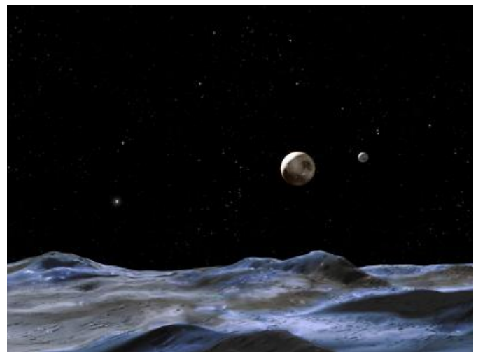
This artist concept shows Pluto and some of its moons, as viewed from the surface of one of the moons. Pluto is the large disk at center. Charon is the smaller disk to the right.